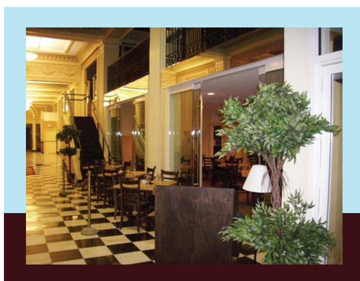
COMPETITIVE LEASE RATES in PORTLAND'S HISTORIC OLD PORT DISTRICT.

Paragon Commercial Real Estate is pleased to offer for lease the Shops at 188 Middle, in the heart of the Old Port in downtown Portland, Maine. This historic building was originally constructed in the 1860's for Canal National Bank. The Shops at 188 Middle has soaring ceilings, marble floors and incredible architecture reminiscent of the turn of the century. The Shops at 188 Middle offers discerning retailers the opportunity to join Chantal. and locate their business in one of Portland's great historic spaces.