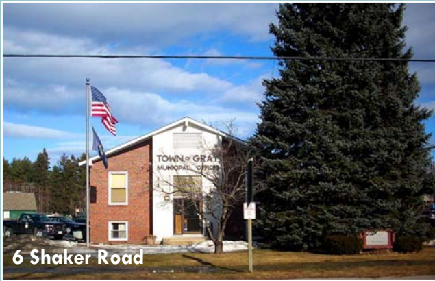
6 Shaker Road

Municipal Assets For Sale In Gray, Maine