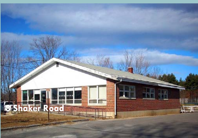
8 Shaker Road