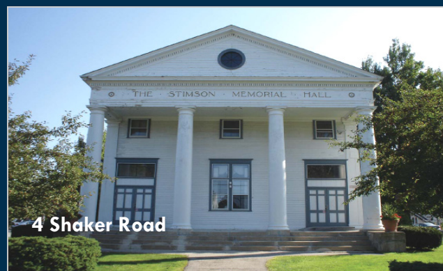
4 Shaker Road